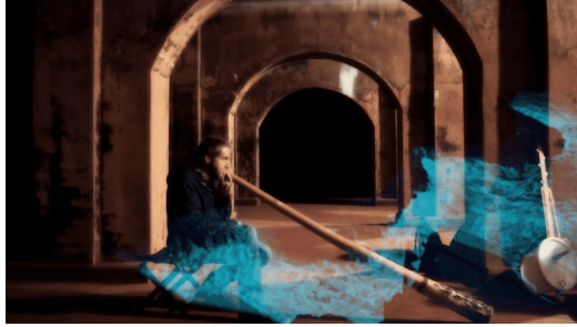
Still from video by Artem Kocharyan for the album 'I.A. Water Reservoir'.