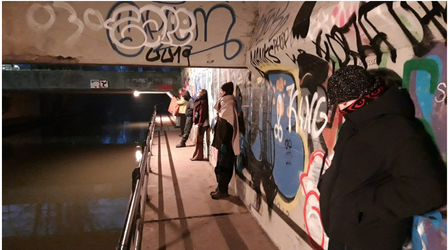
'Landscape Acoustics and Voice' workshop, HKU, Utrecht, 2025.