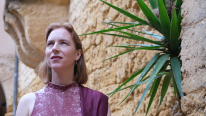
Portrait by Riccardo Santalucia, 2024.

May 18, 2025 / 3 – 6 pm Live performance, Mooi op Oostum, Kerkje op de Terp (Church on the mound), Oostum. Shuttle transport available from Noorderstation, Groningen at 4:30 pm. To reserve your spot, call: 0648531650.